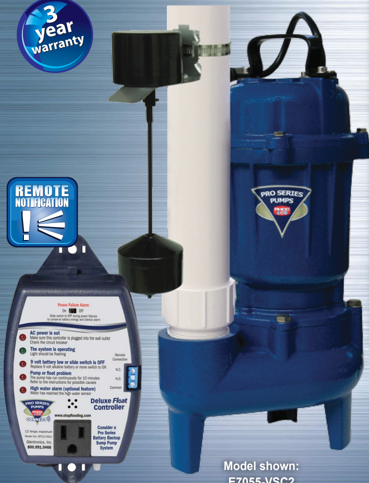
Model shown: E7055-VSC2